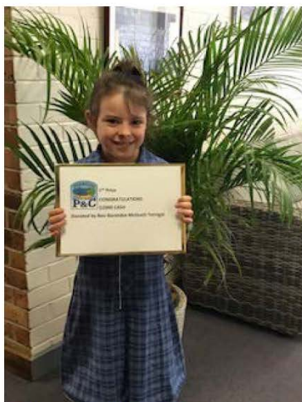
Pollyanna sold the 1 st prize winning ticket to her neighbour.

3rd prize: Big kids bundle 360 Pro Scooter valued at $289 Casey's Toys $50 voucher