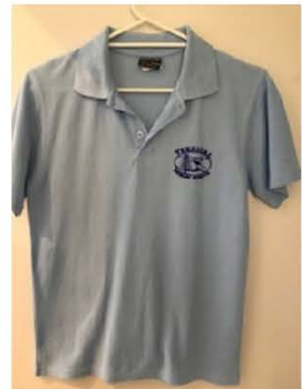
Polo Shirt (Unisex) $22