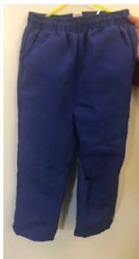
Sport Track Pants $30