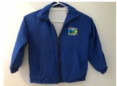
Sport Jacket $45