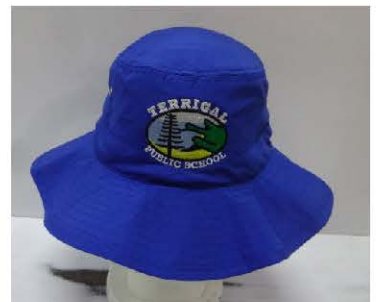
HATS $10 (Sml, Med, Lge)