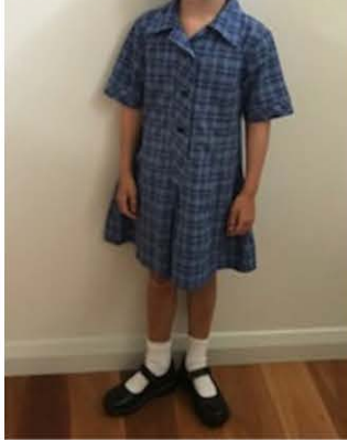
Summer Dress $45

All garments are available in sizes 4 – 16.