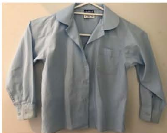
Peter Pan Blouse $26

All garments are available in sizes 4 – 16 unless advised otherwise.