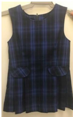
Winter Tunic $57 NEW STOCK HAS ARRIVED