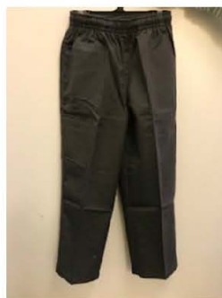
Grey Long Pants $26