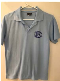
Polo shirt $22