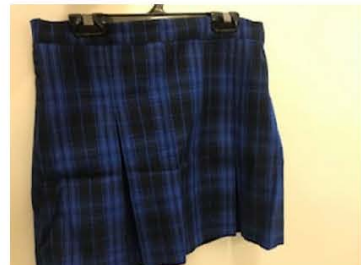
Winter Skirt (Year 5 & 6) $42