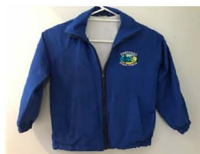
Sport Jacket $45