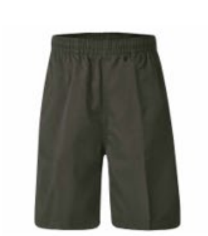
Grey Shorts (Boys) $25 Available in size 3 SUITABLE for Terrigal High