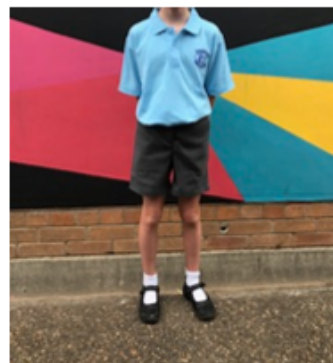
Grey Shorts (Girls) $ 35