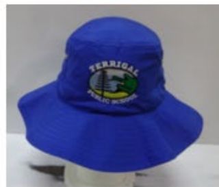
HATS $10 (Sm, Med, Large)