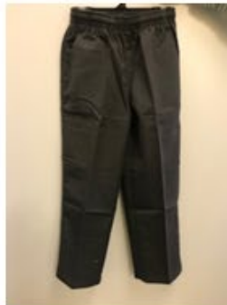
Grey Long Pants (Boys) $26 SUITABLE for Terrigal High