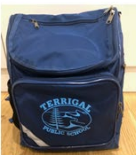
School Bag $40