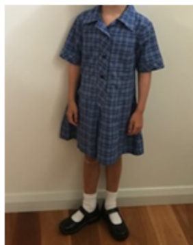
Summer Dress $45

Lost Property is located at the back of the school Hall.