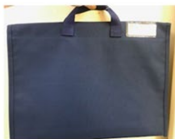
Library Bags $10