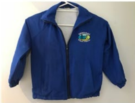
Jackets (Unisex) $45