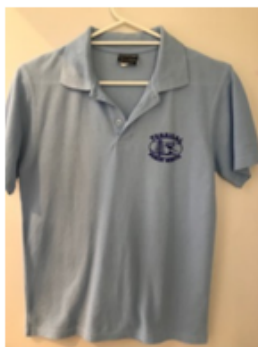
Polo Shirt (Unisex) $22 Available in size 3