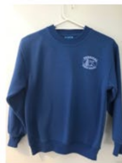
Jumper (Unisex) $25