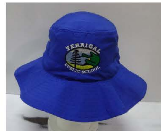
HATS $10 (Sml, Med, Lge)