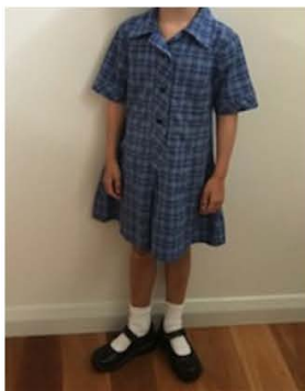
Summer Dress $45

Don't Forget to label all uniform items – especially HATS and JUMPERS.