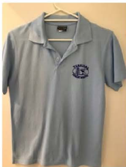
Polo Shirt (Unisex) $22