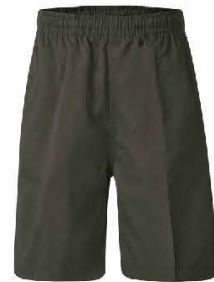
Grey Shorts (Boys) $25