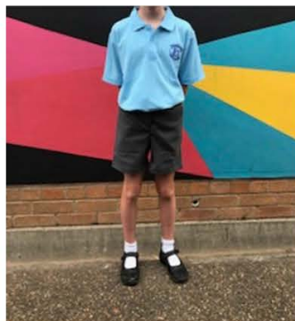
Grey Shorts (Girls) $ 35